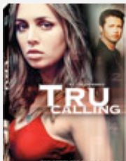
Tru Calling Season 1